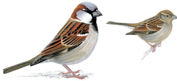
Male and female house sparrows