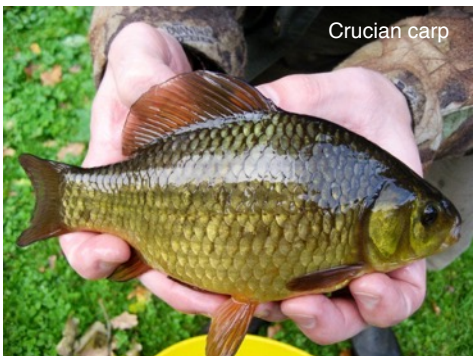
All photos (except bat): © LB of Lambeth

Looking after London's wildlife is a huge and fascinating job.