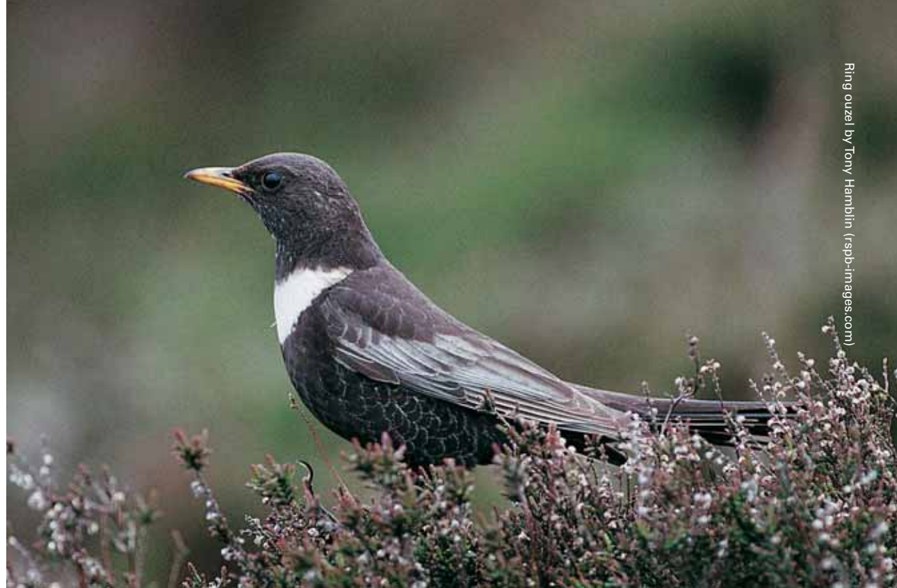
Ring ouzel

The ring ouzel resembles a blackbird; it has a white crescent on its chest, which is most prominent on the male.